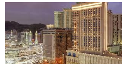
Hilton Suites Hotel

*BILIK BEREMPAT DI MAKKAH : - 2 Standard Beds/King Bed + 2 Pullout Beds - Only for family and friends group