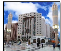
Madinah Oberoi Hotel Upgrade Hotel is $600 per adult