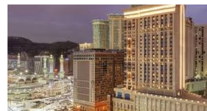
Hilton Suites Hotel

*BILIK BEREMPAT DI MAKKAH : - 2 Standard Beds/King Bed + 2 Pullout Beds - Only for family and friends group