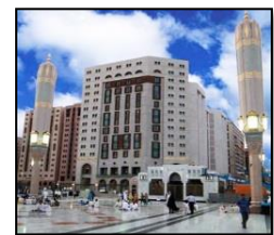
The Oberoi Hotel Upgrade Hotel is $550 per adult / $275 per child