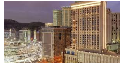
Hilton Suites Makkah