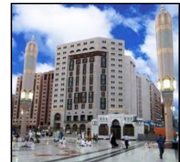
Oberoi Hotel additional $1,500/adult