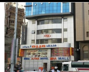
Mira Ajjad Hotel