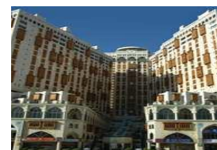
Millennium Towers Apartment